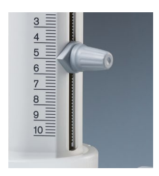
Positive volume setting using interior scalloped track