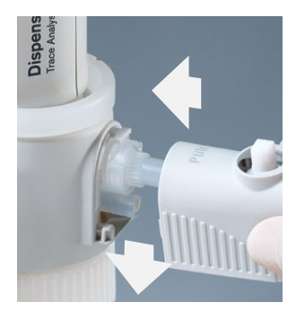
Simple-to-mount discharge tube

The above recommendations reflect testing completed prior to publication. Always follow instructions in the operating manual of the instrument as well as the reagent manufacturer's specifications. Should you require information on chemicals not listed, please feel free to contact BRAND. Status as of: 0815/2