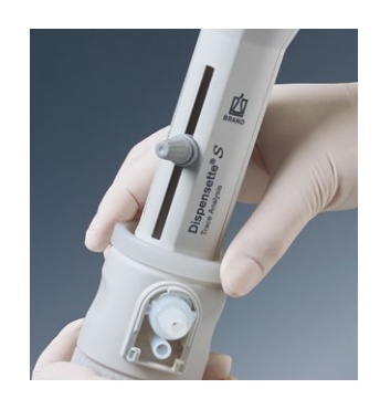
Easy replacement of the complete dispensing unit without tools – dispensing unit is fully adjusted.