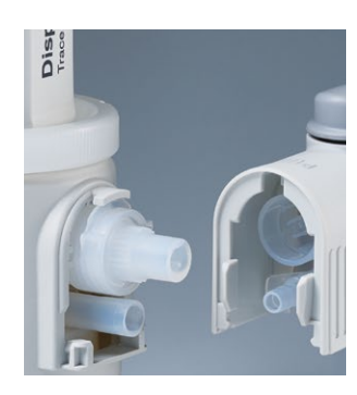
Valve system designed without seals