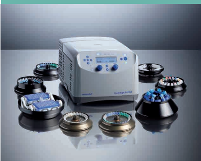
NEW Centrifuge Bundles Page 2