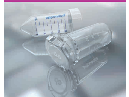
Buy 4, Get the 5 th Box Free Page 4