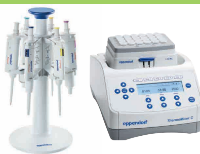
Pipette / ThermoMixer Bundles Page 3